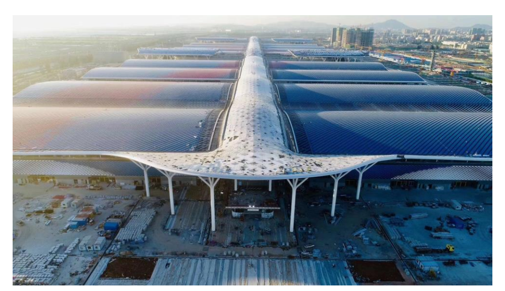
Brand new Intertextile Shenzhen Apparel Fabrics venue: Shenzhen World Exhibition and Convention Center

As events and exhibitions begin to resume in Guangdong province, Intertextile Shenzhen is preparing to welcome new domestic, as well as international exhibitors to China's fashion capital this week from 15 – 17 July. The show will be the first held by Messe Frankfurt since February and this year, has relocated to the larger and brand new Shenzhen World Exhibition and Convention Center, in order to support the fair's development and growth. Following the disruption to production lines and supply chains, the fair will serve as a key platform for the industry to reconnect. And with a market recovery anticipated, Intertextile Shenzhen is ideally positioned as one of the most popular trade events in the region to help exhibitors and buyers of quality fabrics and accessories prepare for the seasons ahead.